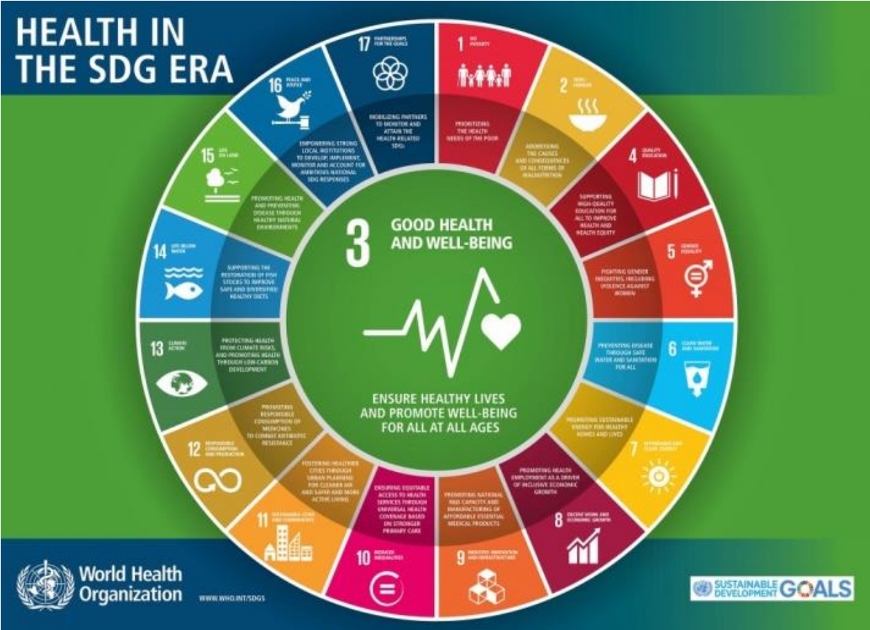
Figure 1 SDGs (WHO, www.who.int/sdg/en/ )

While the SDGs are not legally binding, governments are expected to take ownership and establish national frameworks for the achievement of the 17 Goals. Countries have the primary responsibility for follow-up and review of the progress made in implementing the Goals, which will require quality, accessible and timely data collection. Regional follow-up and review will be based on national-level analyses and contribute to follow-up and review at the global level. All goals are interrelated and are an example of interdisciplinary ambitious policy. Health is affected by and impacts on all other goals as is illustrated below.