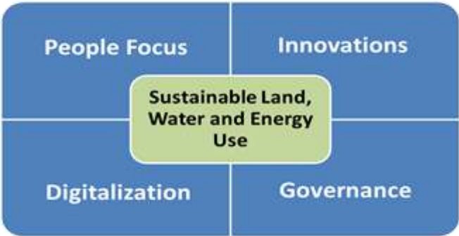
Figure 2: Key Policy Action Areas

To support this process with research based evidence, an integration and consolidation of the myriad of panels and committees at international level in an International Panel on Food, Nutrition and Agriculture (IPFNA) is suggested, partly following the design of the Intergovernmental Panel on Climate Change (IPCC). Existing organizations and mechanisms would form building blocks of such a strengthened food and agriculture governance system. Some re-design in the suggested direction was triggered by the food crisis of 2008, as indicated by the reform of the Committee on World Food Security (CFS) with its High Level Panel of Experts (HLPE), but more is needed. Moving forward, G20 may consider calling for a stakeholder forum that explores the organizational implications of such needed global governance redesign of agriculture and food.