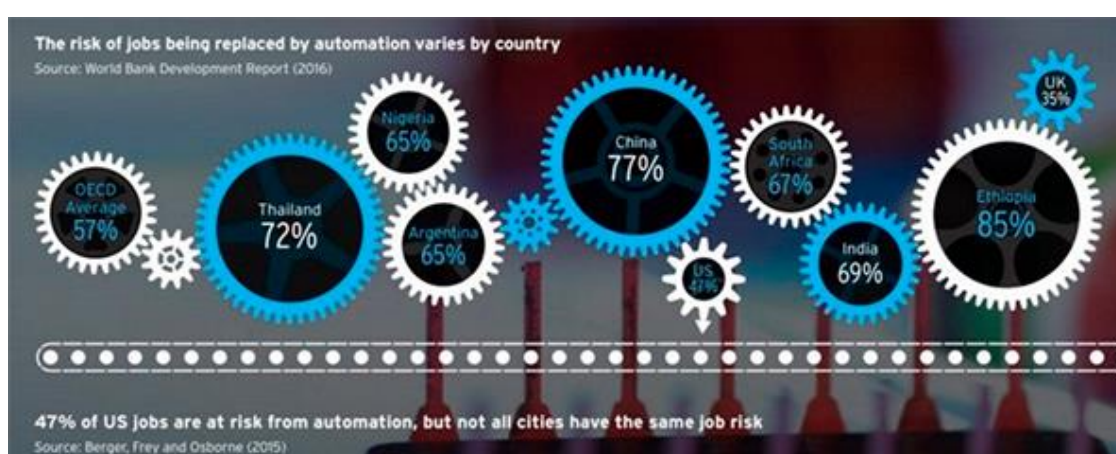
Figure 1. The risk of jobs being replaced by automation varies by country

These forecasts coincide with others -from Holmes & Osborne, 2013- in that the developing world will lose its comparative advantages as jobs are replaced by robots and 3D printing in next 20 years. 6 This is still not fully the case because of the abundance of cheap labour and because automation is still expensive in many aspects beyond the automotive and electronics sectors.