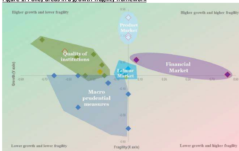
Figure 1. Policy areas in a growth-fragility framework

Note: Structural policies should be assessed on the basis of their effect on growth and economic fragility. In this chart, the effect of policies on economic fragility is plotted on the horizontal axis, the effect on growth is shown on the vertical axis. Fragility is defined as a higher likelihood of financial crises (banking, currency, or twin crisis) or a higher GDP (negative) tail risk. Different risk-growth patterns emerge for each policy area considered—pro-growth labour and product market policies improve economic performance without substantially affecting economic fragility. Better quality of institutions both increases growth and reduces economic fragility. However, macroprudential and financial market policies entail a growth-risk trade-off—the former decrease economic risk to the detriment of a higher growth rate, the latter promote growth but also increase financial risk.