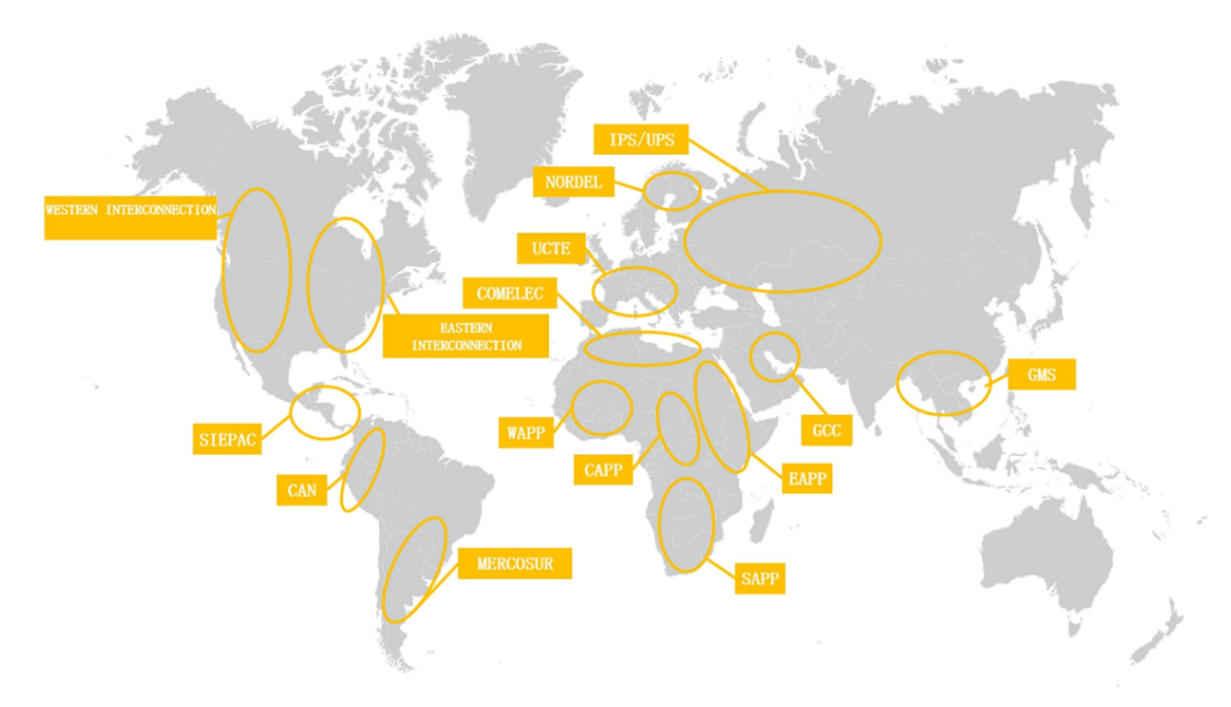
Figure 1: Regional Power Integration Schemes