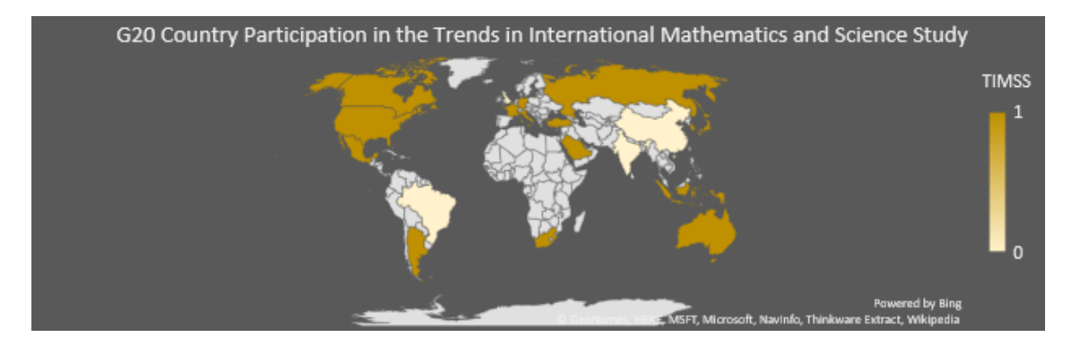
Figure 3c: G20 country participation in the Trends in the International Mathematics and Science Study. Data sourced from IEA TIMSS (2020).

Figure 3b: G20 country participation in the ICCS. Data sourced from IEA ICCS (Country Participation) homepage.