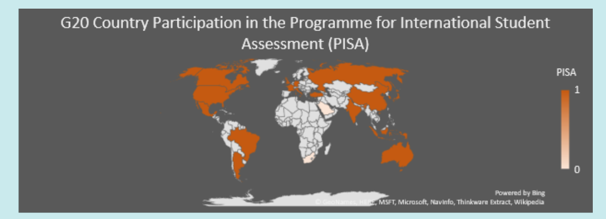
Figure A2: G20 Country Participation in the Programme for International Student Assessment (PISA). Data sourced from OECD (2020).