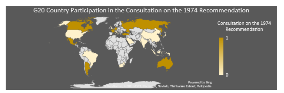
Figure 3a: G20 country participation in the consultation for the 1974 Recommendation. Data sourced from UNESCO (2016).