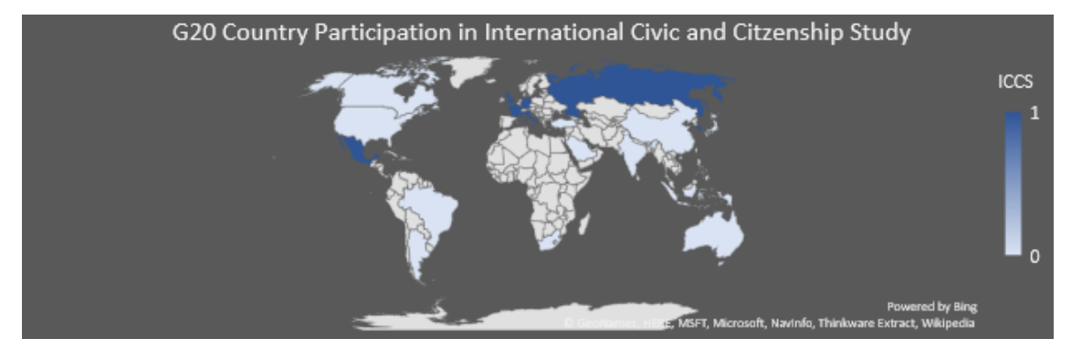
Figure 3b: G20 country participation in the ICCS. Data sourced from IEA ICCS (Country Participation) homepage.