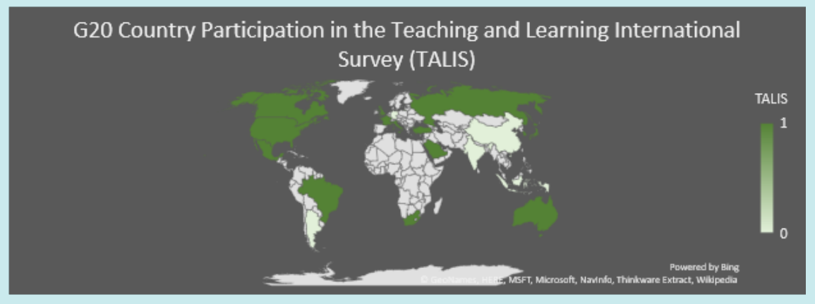
Figure Al: G20 Country Participation in the Teaching and Learning International Survey (TALIS). Data sourced from OECD (2018a).