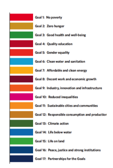
Figure 1. A roadmap to integrated Early Childhood Development, Education, and Care for Sustainable Development