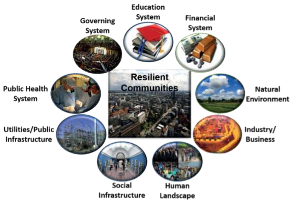
Figure 1. High-level Systems for Cities and Communities

New social science theories indicate that investing in the social aspects of a city can pay long-term dividends for daily quality of life and risk reduction in the long term. Thought leaders link investments in things like sidewalks, community centres, public libraries and parks to create what is termed “loose social ties”. Studies have shown that these public spaces play a role in helping a community grow in social and economic dimensions, and investment in social environments can help create areas where social bonds and cohesion grow. Cohesion is the “social fabric” of a society, which binds a community together and plays a role in all phases of risk reduction, relief and rebuilding after a crisis. (Aldrich, 2017). This social fabric is built from supportive connections that exist among individuals, and social capital is at times called “soft resilience” (Ross, 2014). The connections may be strong, as in bonding social capital, which connects tribes, families and close friends. Social ties may be loose, as may be the case for neighbours on the same block or casual acquaintances who frequent the same public library.