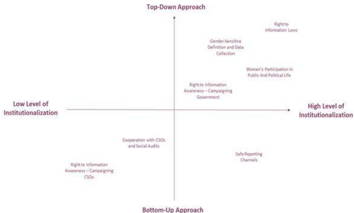
FIG. 1 - SUMMARY OF RECOMMENDATIONS

The recommendations formulated in this brief aim to outline an approach that is both bottom-up and top-down, to achieve gender-sensitive anti-corruption agendas through varying levels of institutionalisation. The recommendations are summarised in the figure below.