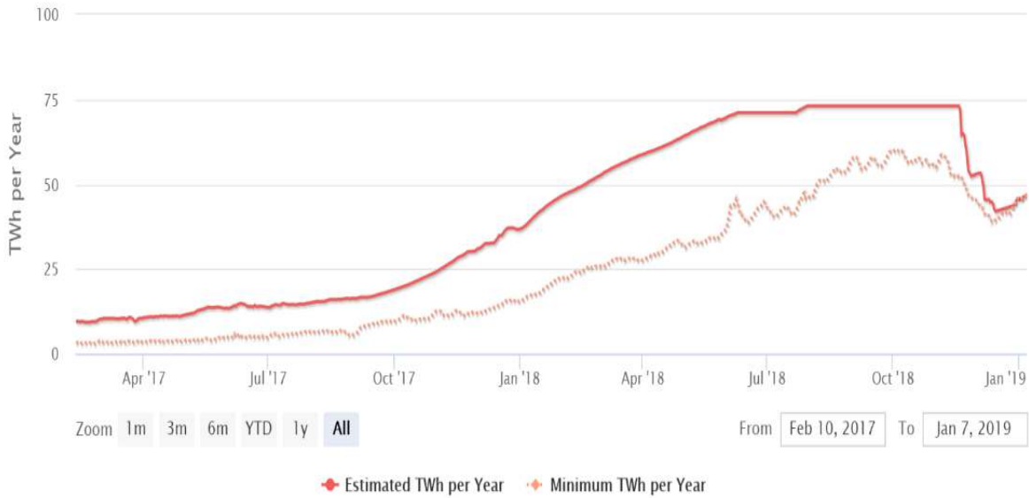
[Chart 1] Bitcoin Energy Consumption Index

G20 countries should carefully monitor the prices of crypto-assets and mining business if they have an impact on the global environmental problem and lead distortion of global resource allocation.