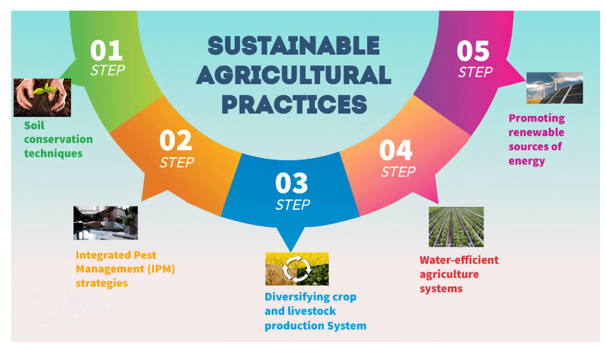
Figure 4: Sustainable Agricultural Practices

Source: Wezel et al.,<sup>21</sup> and Altieri<sup>22</sup>