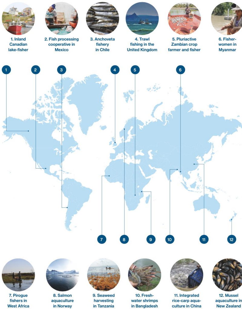
Fig. 1 – Blue food production systems. From BFA report.